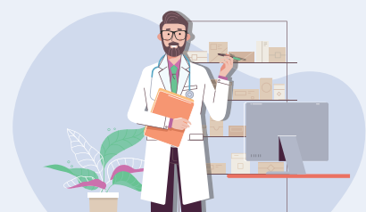
Only Local Consultation