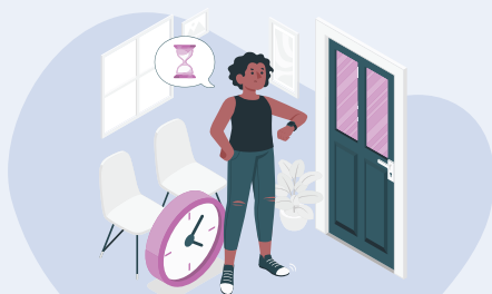
High Wait Time